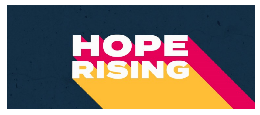
Hope is Heaven April 10-11, 2021